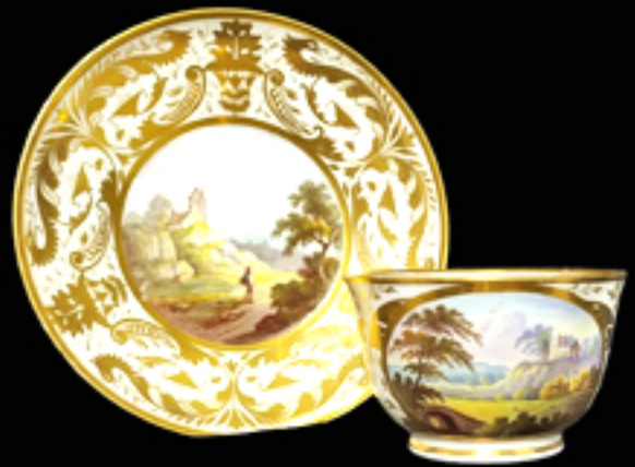
38. Derby teacup and saucer with elaborate classical gilding painted with 'In Wales' and 'In Scotland'. red mark, (saucer) 5.5 ins. D. c.1805-10