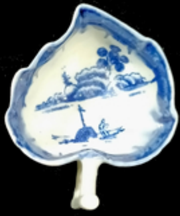
104. Derby leaf shaped butterboat printed and painted in underglaze blue no mark, 2.625 ins. H. c. 1775-80