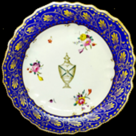
99. Chelsea Derby plate finely painted in neo-classical style with a central urn, scattered sprays and sprigs, and bright blue and gilt border, no mark, 8.625 ins. D. c. 1780