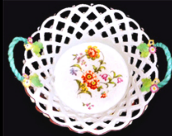
26. Derby two handled pierced basket painted with flowers by the Cotton Stem Painter, no mark, 6.75 ins. W. c. 1758-60