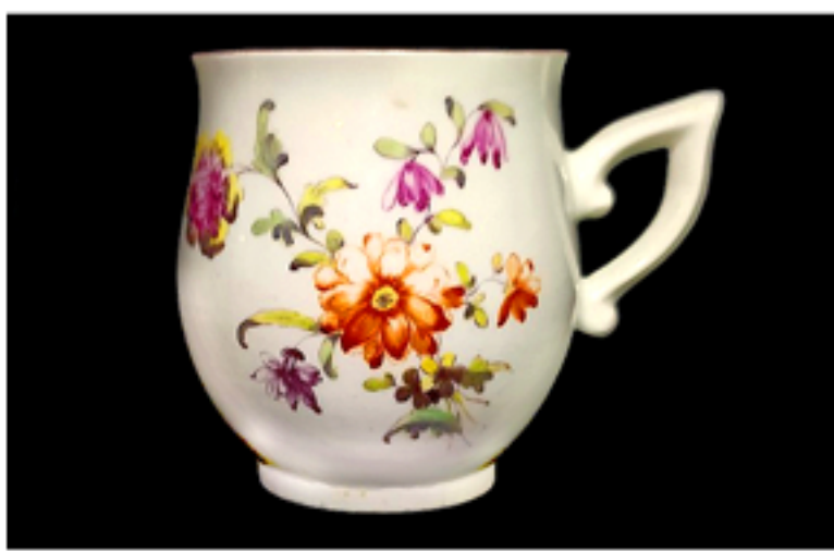
20. Derby coffee cup with moulded handle painted with flowers by the Cotton Stem painter, no mark, 2.5 ins. H. c. 1758-60