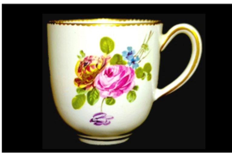
110. Derby fine coffee cup painted by Wm. Billingsley two large floral bouquets, no mark, 3 ins. D. c. 1790-95