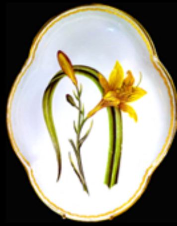
80. Derby botanical moulded oval dish painted with 'Yellow Day Lily' under leafy and line borders, probably by one of the Brewers, pattern 141, Blue mark, 9.75 ins. H. c. 1790-1800