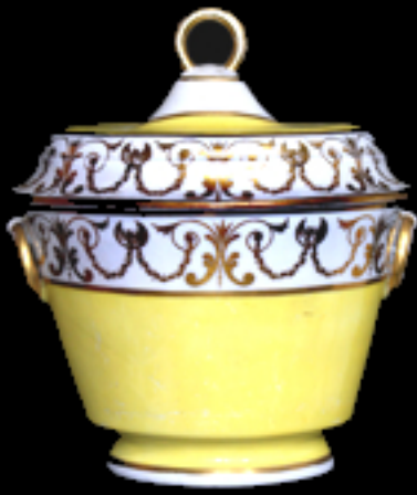
67. Derby rare yellow ground sucrier and cover with two classically gilded borders and gilt ring handle, puce mark, 6.5 ins. H. c. 1795-1800