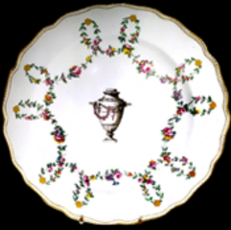
97. Chelsea Derby plate finely painted in neo-classical style with a chain of roses, leaves and other flowers enclosing an urn, Anchor 'D' mark 8.5 ins. c. 1775