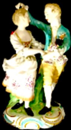
11. Derby group of a young man and woman dancing, he with his hand upon her head, both standing on a rococo scroll base, patch marks, 7. ins. H. c. 1771-75