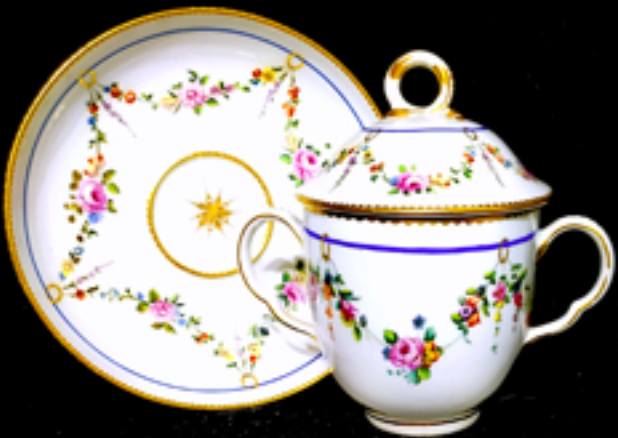
65. Chelsea Derby chocolate cup and cover painted with a large spray of flowers Anchor 'D' in gold (saucer) 5.75 ins. D. c.1775