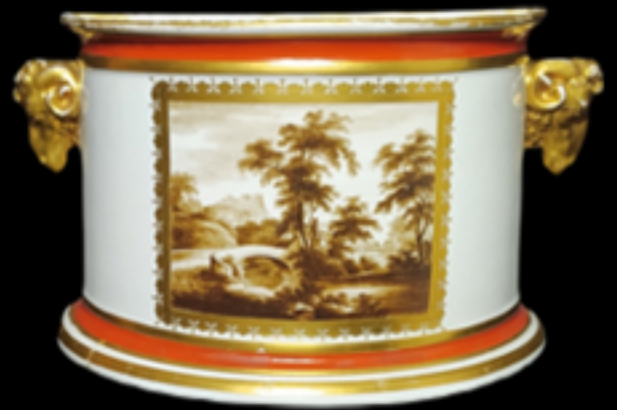
70. Derby bough pot and cover with ram's head handles painted with 'At Stoke Bridge Near Edinburgh' puce mark, 9.5 ins. W. c. 1800