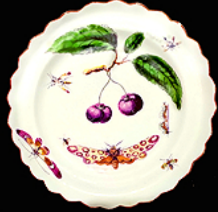
4. Derby scalloped plate or butter tub painted with cherries and moths in the style of the Moth Painter, no mark, 6.625 ins. D. c. 1765-68