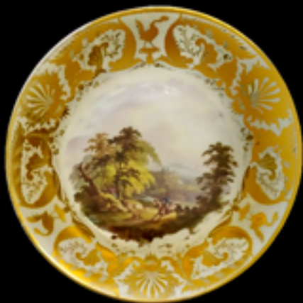
41. Derby plate with elaborate classical gilding painted with 'Near Dorking, Surrey', red mark, 8.75 ins. D. c.1810-15