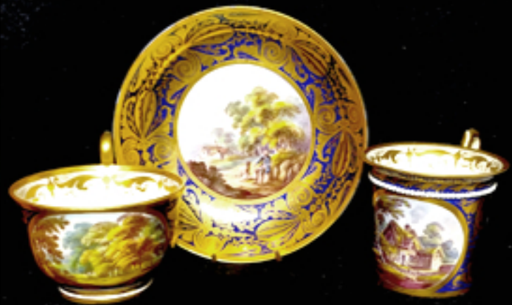
40. Derby coffee cup, teacup and saucer with elaborate classical gilding painted with three landscapes probably by Robert Brewer, red mark, (saucer) 5.4 ins. D. c. 1815-20