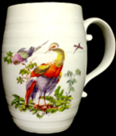
1. Derby barrel shaped mug painted with fancy birds in landscape, verso with a bird on a branch, no mark, 5.75 ins. H. c. 1758-62