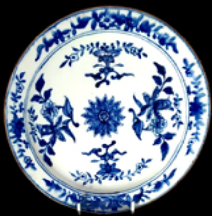
107. Derby plate painted in underglaze in Chinese style with a flowerhead surrounded by trailing flower sprays, the rim with a brown line, no mark, 8.5 ins. D. c. 1770-75