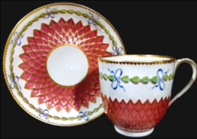
58. Chelsea Derby coffee cup & saucer with pineapple moulding highlighted in claret under a leaf and tied ribbon border, no mark, (saucer) 5 ins. D. c. 1772-75