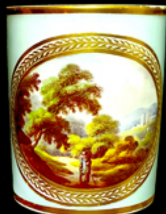
42. Derby cylindrical vase or beaker having turquoise ground and elaborate oval gilt panel with man in mountain landscape, red mark c. 1810-15