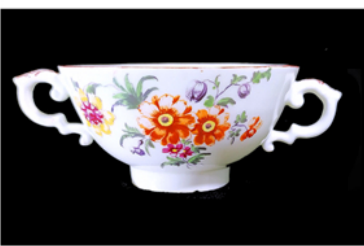
19. Derby two handled cup painted with flowers by the Cotton Stem painter, no mark, 5.5 ins. W. c. 1758-60