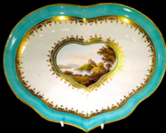
44. Derby heart shaped dish painted with 'On the River Trent' in a heart shaped gilt panel under a gilt and turquoise border, black mark, 9.875 ins. W. c. 1795 -1800