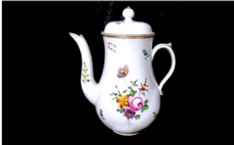
34. Derby coffee pot and cover of large size with a bright floral sprays and sprigs, no mark 9 ins. H. c. 1775-80