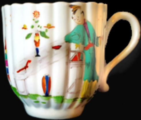
15. Derby coffee cup of fluted form painted with an oriental figure beside a table, another figure verso, no mark 2.5 ins. H. c. 1758-60