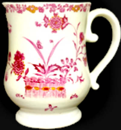
3. Derby silver shaped mug painted in puce with the banded hedge, no mark, 4 ins. H. c. 1760