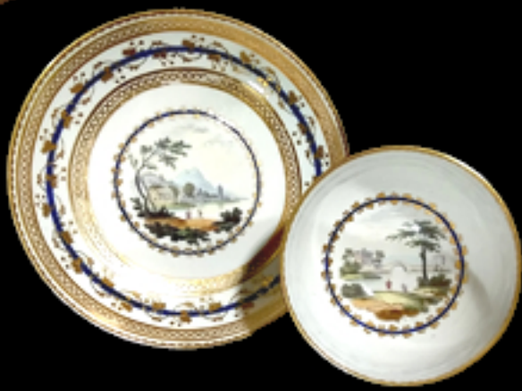
37. Derby teabowl and saucer painted with two landscapes by Zachariah Boreman Pattern 86, puce mark, (saucer) 5 ins. D. c. 1790-95