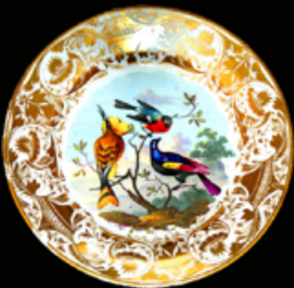
53. Derby plate painted probably by Richard Dodson with a group of fancy birds perched on a tree within an elaborately gilded border, red mark, 8.75 ins. c. 1815-25