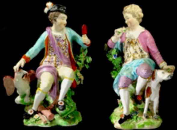
10. Derby pair of figures of two boys from the senses depicting Sight with a mirror and Smell holding a flower to his nose, each seated beside a bird or dog, patch marks, 7 ins. H. c. 1765 -75