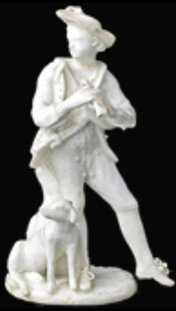
7. Derby dry edge figure of the Piping Shepherd, with a dog at his side no mark, 5 ins. H. c. 1752-55