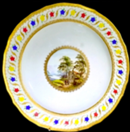
45. Derby plate painted with 'Coniston Lake' by G. Robertson, from the Blenheim service, pattern 178, Blue crown, batons 'D' mark, 9.5 ins. D. c. 1795