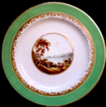
51. Derby plate painted with a central landscape titled 'Lake of Perugia, Italy', under a green border by George Robertson, pattern 343, blue mark 9.5 ins. D. c. 1790