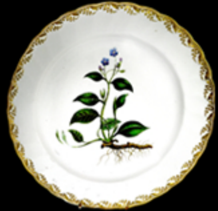
76. Derby botanical plate painted with 'Blue Navelwort' under a leafy gilt border, titled, Pattern 115, Blue crown batons 'D' mark, 9.125 ins. D. c. 1795-1800