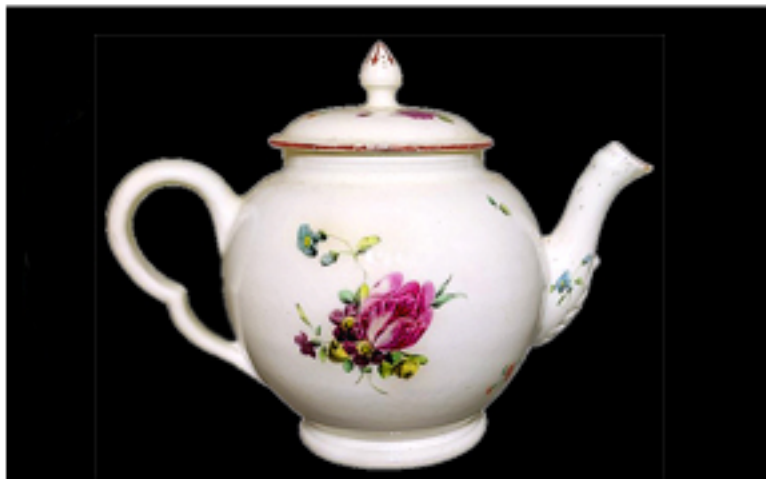
22. Derby small size teapot and cover painted with a floral spray & random sprigs including a tulip, with ear shaped handle and crabstock spout, no mark, 6.5. ins. W. c. 1772-78