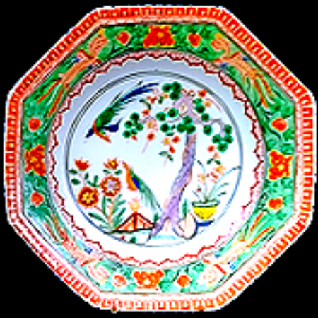
49. Derby rare octagonal plate painted with a Chinese garden landscape in famille rose style, no mark, 8 ins. D. c. 1800