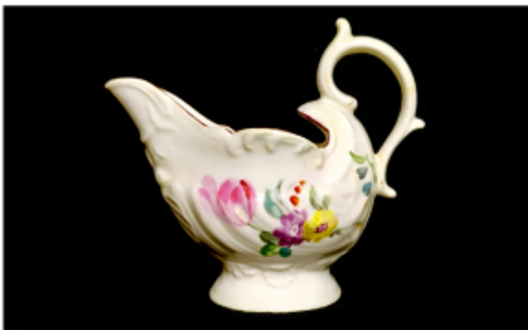
111. Derby shell moulded ewer painted with coloured flowers, no mark, 4.15 ins. W. C. 1762-68