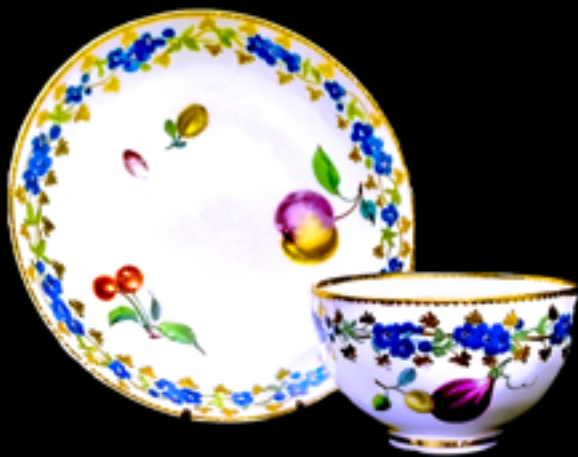
57. Chelsea Derby teabowl and saucer painted with apples, cherries a fig, and other fruit, Gold Anchor mark, (saucer) 5 ins. D. c. 1772-75