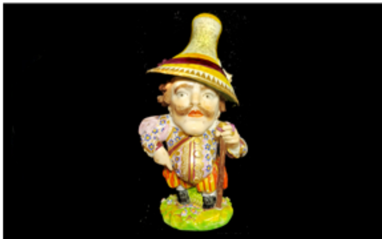
112. Derby Mason Dwarf, his hat having an inscription, his left hand holding a stick, incised 227 to base 7 ins. H. C. 1820-30