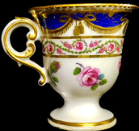
89. Derby rare ice cup painted with five large roses and a band of roses by Wm. Billingsley, puce mark, 2.5 ins. H. c. 1791-95