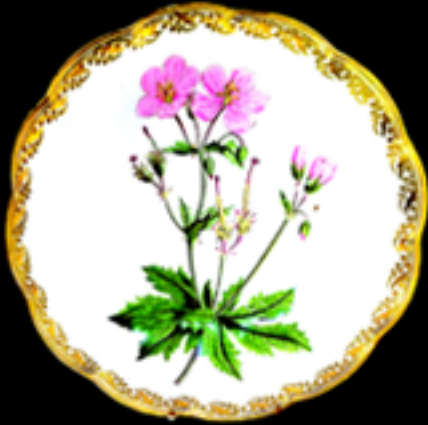
75. Derby botanical plate painted with 'Crane's Bill' under a leafy gilt border, titled, Pattern 115, Blue crown batons 'D' mark, 9.125 ins. D. c. 1795-1800