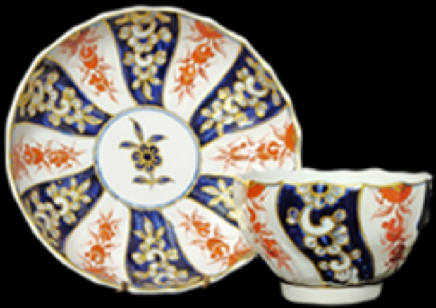
55. Chelsea Derby moulded teabowl and saucer painted with a variation of the Queen Charlotte pattern, Anchor 'D' in gold, (saucer) 5 ins. D. c. 1772-75