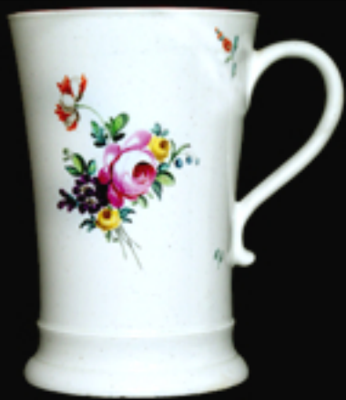
25. Derby mug of rare tall conical shape with kick handle painted with flowers, rare incised 'N' mark, 6.25 ins. H. c. 1758-60