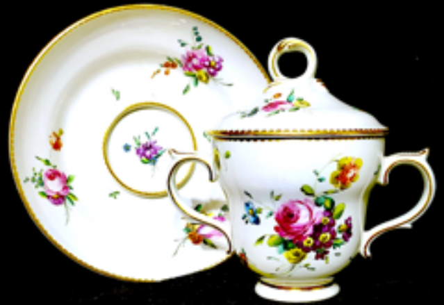
64. Chelsea Derby chocolate cup and cover painted with a large spray of flowers, Anchor 'D' in gold, (saucer) 5.5 ins. D. c.1775