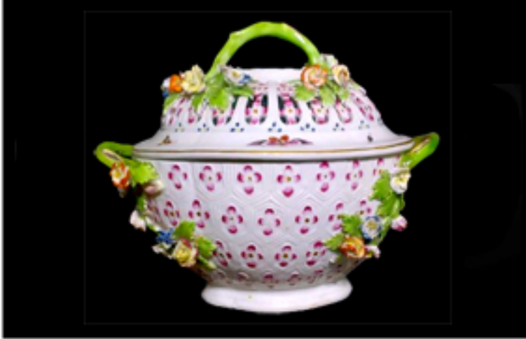
31. Derby tureen and cover with three handles, moulded and floral encrusted with leaves and flowers, patch marks, 8.25 ins. W. c. 1765-68