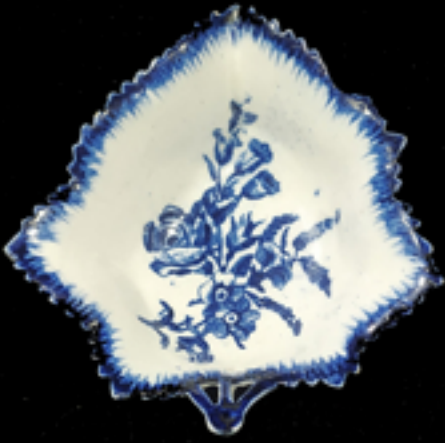
103. Derby deep pickle leaf dish with triple stalk handle, printed with a loose spray, including a rose and a rosebud, within a feathered border and serrated rim, 4.75 ins. H. c. 1770-75