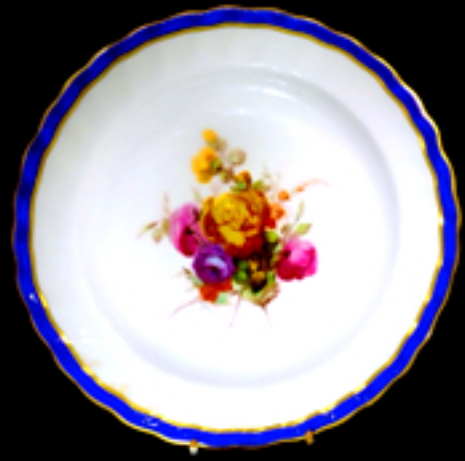
86. Derby moulded plate painted with a large spray of colourful flowers under a blue and line gilt border, pattern 100 by Wm. Billingsley, puce mark, 8.625 ins. D. c. 1795