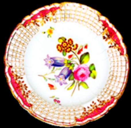
92. Derby fine pierced border plate painted with bold flowers by Leonard Lead, red Bloor mark, 9.75 ins. D. c. 1810-15