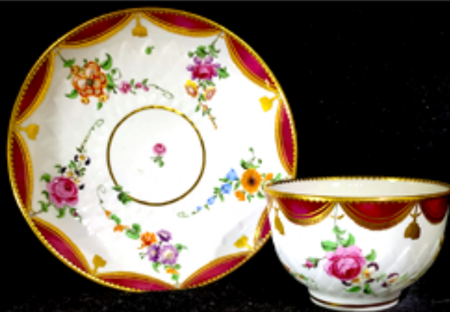
60. Chelsea Derby moulded teabowl and saucer painted with formal flower sprays under a crimson curtain border, Gold Anchor mark, (saucer) 5 ins. D. c. 1772-75