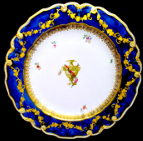
98. Chelsea Derby plate finely painted in neo-classical style with a central urn, scattered sprigs and a dark blue and tooled gilt border Gold anchor mark 9 ins. D. c. 1772-75