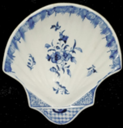
105. Derby underglaze blue shell shaped pickle dish painted with flowers, the handle with two border patterns, c. 1770