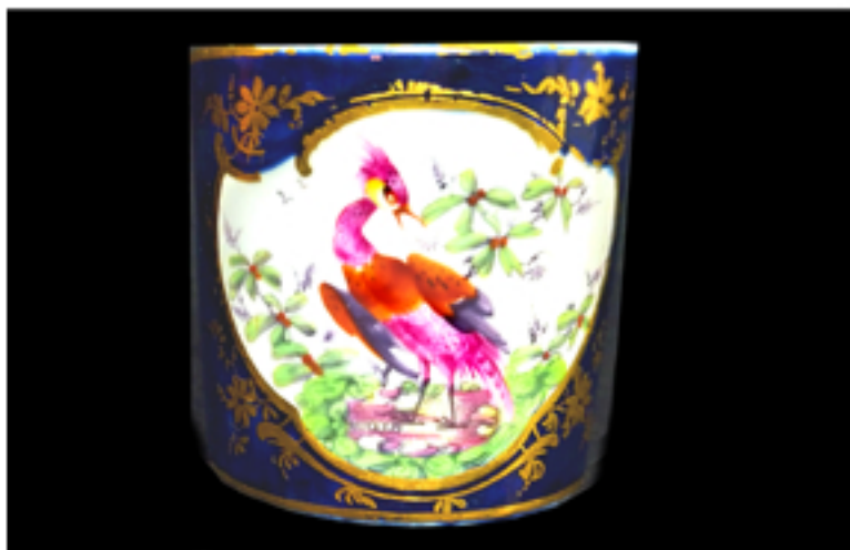
24. Derby toilet pot painted with fancy birds in landscape on a cobalt blue and gilt ground, patch marks, 2 ins. H. c. 1762-65