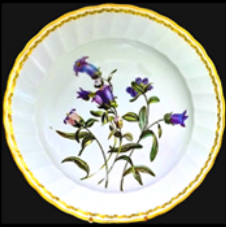
73. Derby botanical plate painted with 'Canterbury Bells' under a leaf gilt border, titled, Pattern 141, Blue crown batons 'D' mark, 8.875 ins. D. c. 1795-1800