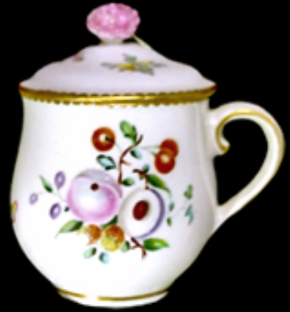
62. Chelsea Derby custard cup and cover painted with a large spray of flowers, Anchor 'D' in gold 3.25 ins. H. c.1775