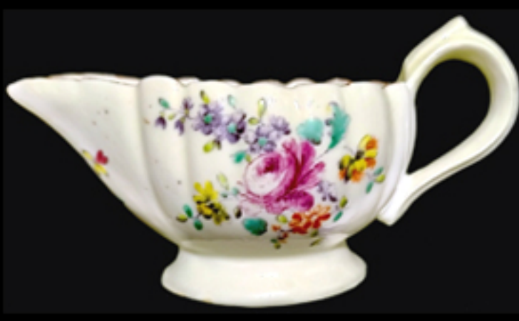
28. Derby fluted creamboat with pedestal foot painted with a large floral spray, patch marks 4.75 ins. W. c. 1758-62