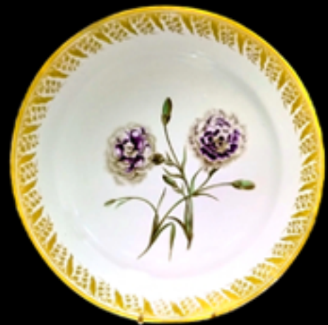
78. Derby botanical plate painted with 'Common Pink' under a leafy gilt border, titled, pattern 115, Blue crown batons 'D' mark, 9.125 ins. D. c. 1795-1800