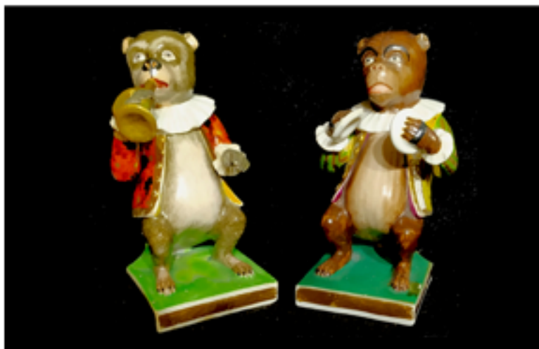
115. Derby figure of a Monkey playing a trumpet, no mark, 4ins. H.