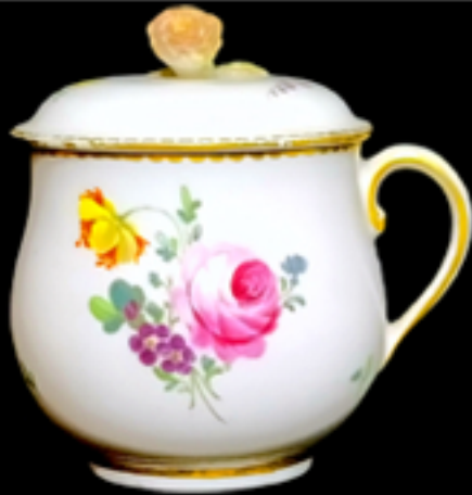
63. Chelsea Derby custard cup and cover painted with a large spray of flowers Blue crown 'D' mark, 3.25 ins. H. c.1780