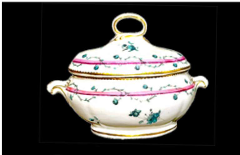
36. Chelsea Derby tureen and cover painted with green vines entwined in two puce lines, Blue crown 'D' mark 7.25 ins. W. c. 1775-80