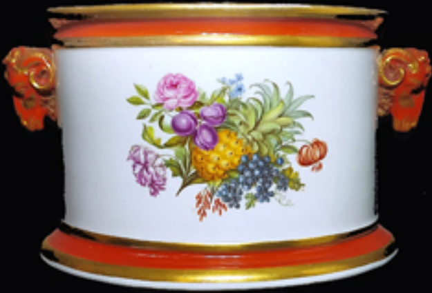
69. Derby bough pot and cover with ram's head handles painted with a pineapple, grapes and flowers, puce mark, 9.5 ins. W. c. 1800