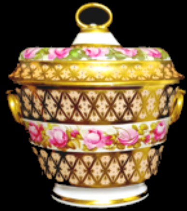
68. Derby magnificent sucrier and cover with two continuous rose panels and gilt ring handle, puce mark 529, 6.5 ins. H. c. 1795-1800