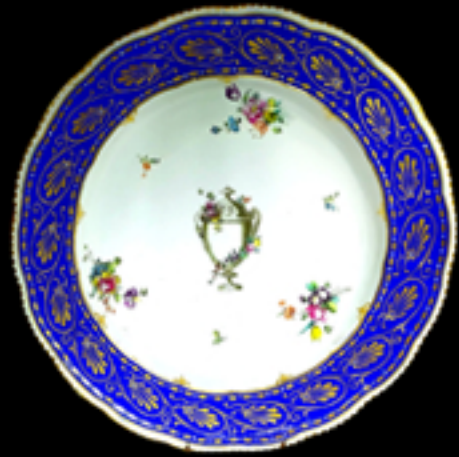
100. Chelsea Derby plate finely painted in neo-classical style with a central urn, scattered sprays and sprigs, and bright blue and gilt border, Blue crown 'D' mark, 9.5 ins. D. c. 1780