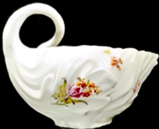
27. Derby rare and important small cos lettuce leaf moulded sauceboat, delicately painted with scattered flower sprays, unmarked. 4.875 ins. W. c. 1753-55 (decoration) Duesbury I c. 1756