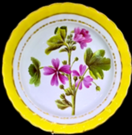
77. Derby botanical plate painted with 'Marsh Mallow' under a mustard yellow border, titled, pattern 216, Blue crown, batons 'D' mark, 9 ins. D. c. 1795-1800