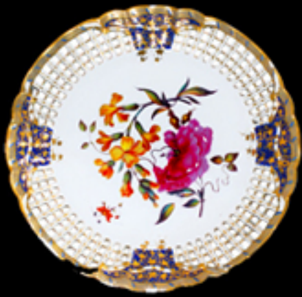
91. Derby fine pierced border plate painted with asymmetrical flowers by 'Quaker' Pegg, red mark, 9.75 ins. D. c. 1810-15 cf. Bonhams, 8-4-09 Lot 302