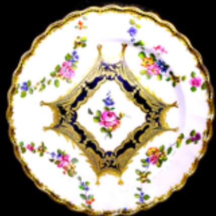
90. Chelsea Derby fine plate with painted with festoons of flowers, a rose spray painted within an elaborate gilt panel, no mark 8.375 ins. D. c.1772