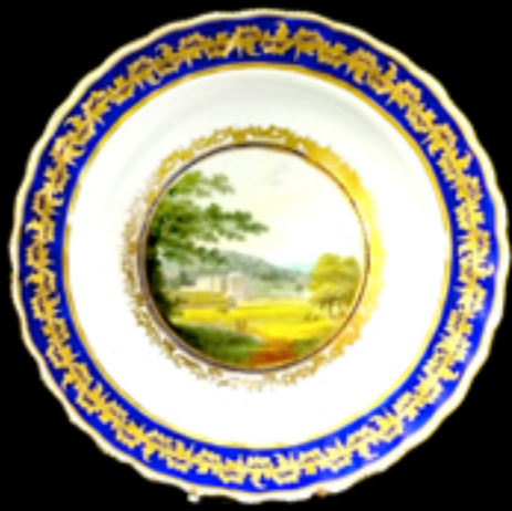
43. Derby plate painted with 'View of Kedleston Hall' under a blue & gilt border, attributed to Zachariah. Boreman, Blue crown, baton 'D' (pattern) 50 mark, 8.5 ins. D. c. 1795-1800