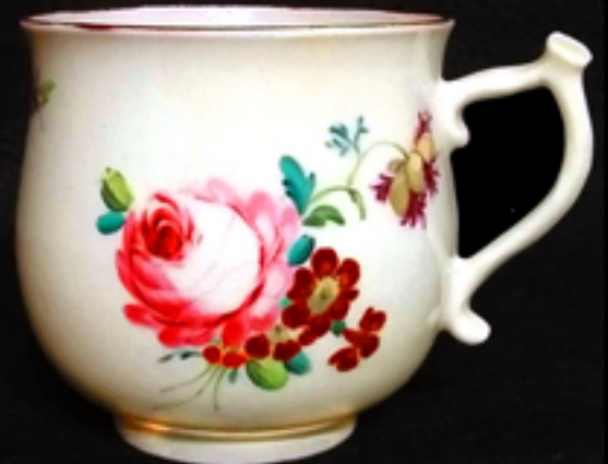
18. Derby coffee cup with moulded twig handle painted with Withers style flowers, including a large rose, no mark, 2.5 ins. H. c. 1762-68 Prov: Wilders Col.