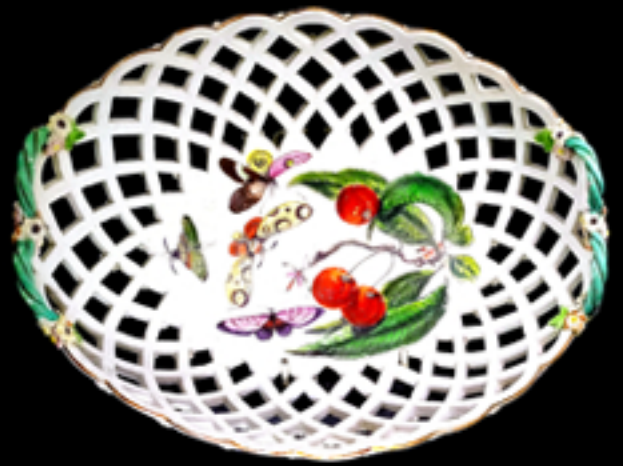
2. Derby pierced basket with turquoise handles painted with cherries and moths in the style of the Moth Painter, Patch marks, 11.25 ins. W. c. 1765-68