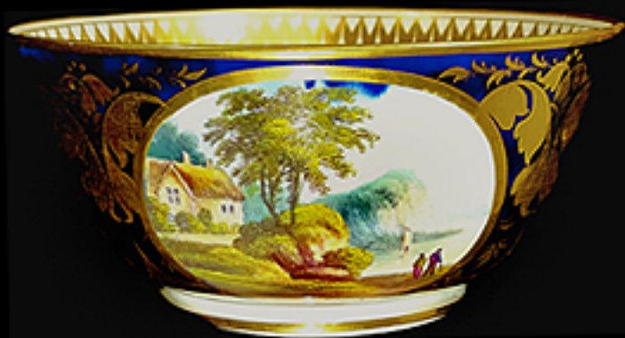
47. Derby bowl painted with titled landscapes, 'In Westmorland' and 'In Deveshire' on a cobalt blue and gilt ground, red mark, 6 ins. D. c. 1815-20