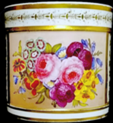
94. Derby porter mug, painted with a gold panel depicting full-blown flowers, red mark 4.375 ins. H. c. 1815-20