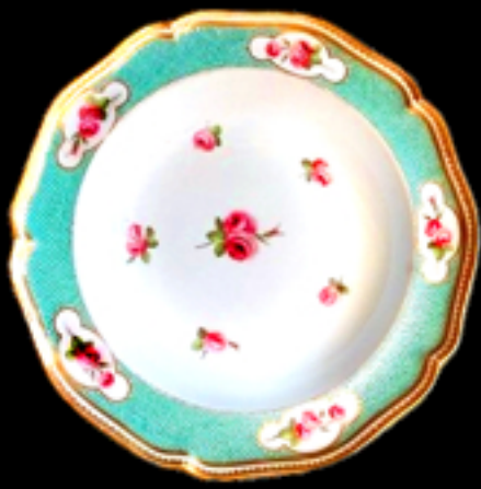
85. Derby plate painted with roses, the green dot border with five panels containing roses, from a service made for the Marquis of Bath, at Longleat, red mark, 9.5 ins. D. c.1810