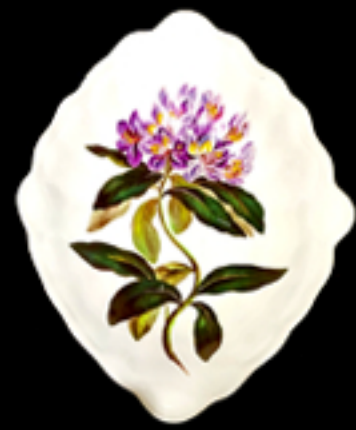
82. Derby botanical shaped oval dish painted with a 'Rhododendron' by 'Quaker' Pegg, Blue mark, 11.75 ins. H. c. 1796-1801