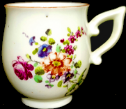
17. Derby coffee cup with wishbone handle painted with flowers by the Cotton Stem painter, no mark, 2.5 ins. H. c. 1760-62