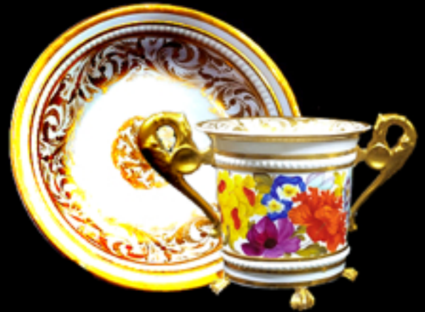
96. Derby beaded griffin handled chocolate cup and saucer on four feet, the cup painted with a continuous floral design, the inside gilt border matching the saucer, red mark (saucer) 5.4 ins. H. c. 1815