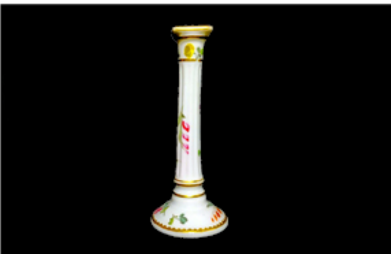
23. Derby early taperstick painted with flowers, having dentil gilding to the base, patch marks, 4.75 ins. H. c. 1765-68