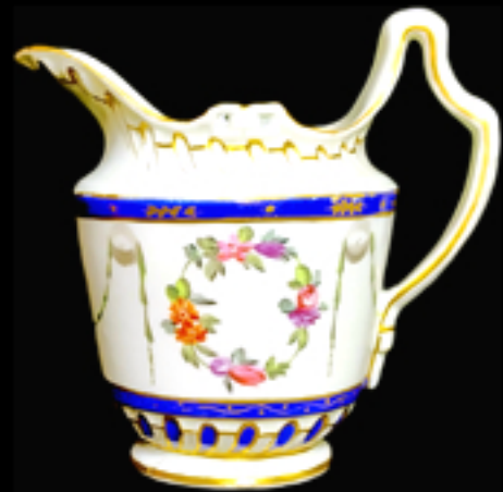
102. Chelsea Derby cream jug painted in neo-classical style with wreaths of flowers and acanthus leaf chains between blue borders, Blue crown 'D' mark, 4 ins. H. c. 1780