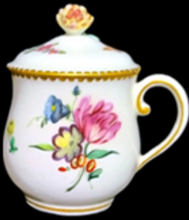
61. Chelsea Derby custard cup and cover painted with a large spray of flowers, Anchor 'D' in gold, 3.5 ins. H. c. 1775