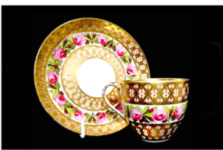
109. Derby fine teacup and saucer painted with pattern 529 by Wm. Billingsley with roses in continuous panel, puce mark, (saucer) 5.5 ins. D. c. 1791-95