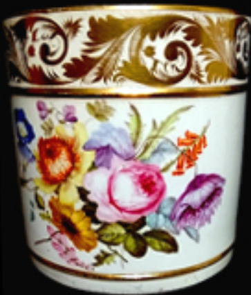
95. Derby porter mug, painted with a gold panel depicting full-blown flowers, red mark 5 ins. H. c. 1815-20