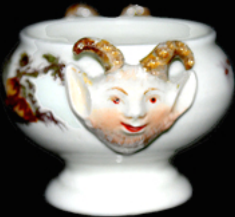
5. Derby ointment pot with mask heads painted with a landscape & two flying insects, no mark, 3 ins. W. c. 1760