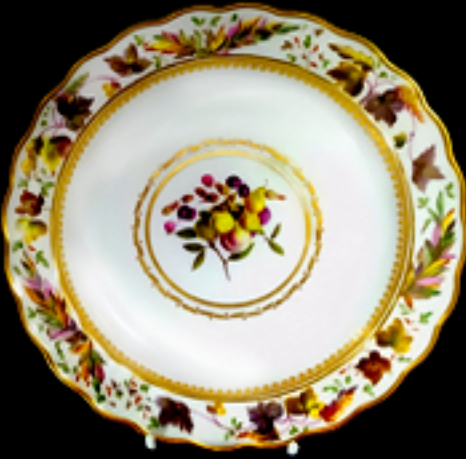
93. Derby fine plate painted with fruit and nuts by Geo. Complin with in two gilt borders, the rim with a coloured leafy border, puce mark 140, 7.625 ins. D. c. 1791-95