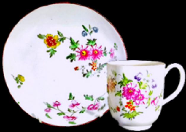
13. Derby early coffee cup and saucer painted in Cotton Stem style with meandering floral sprays, no mark (saucer) 4.875 ins. D. c. 1758-62