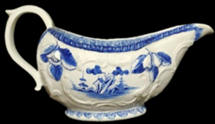
108. Derby sauceboat moulded with panels, flanked by flowers and fruit, painted in bright blue with Chinese buildings beside a diagonal rock, no mark, 8.25 ins. W. c. 1760-65