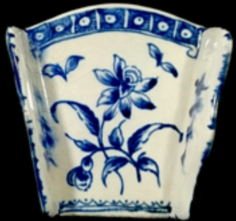
106. Derby asparagus server painted a Narcissus under a cell border, no mark, 3 ins. H. c. 1770