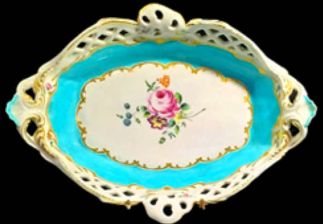
72. Chelsea Derby oval pierced basket with turquoise ground, the centre with a rose bouquet, Gold anchor 'D' mark, 8.75 ins. W. c. 1775-78