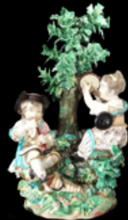
12. Derby group of two child musicians, he with a pipe and her with a tambourine seated on rock by a tall tree, patch marks, 10 ins. H. c. 1775