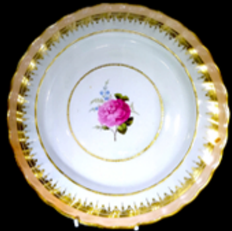
88. Derby moulded plate painted by Wm. Billingsley with a large central rose and a sprig of forget-me-nots enclosed by a salmon and gilt border, puce mark 152, 9 ins. D. c. 1790-95