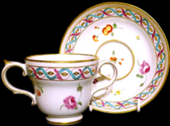
87. Chelsea-Derby caudle cup & trembleuse stand painted with a band of flowers inside undulating blue and pink ribbons, and scattered flowers, Gold Anchor mark (saucer) 5.5 ins. D. c. 1775