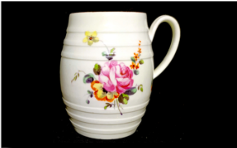
33. Derby barrel shaped mug painted in bright colours with floral sprays and sprigs, no mark, 4 ins. H. c. 1768-72