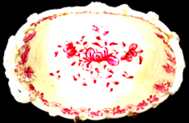
6. Derby rare two handled miniature basket painted in puce with central flowers, the border with a band of flowers, no mark, 3.75 ins. W. c. 1758-62