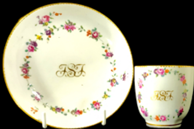
56. Chelsea Derby coffee cup and saucer painted with a circular chain of flowers and gold initials, FSF, Anchor 'D' in gold, (saucer) 5.125 ins. D. c. 1772-75