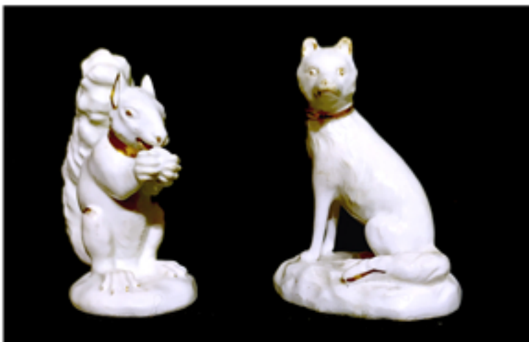
113, Derby white and gilt figure of a squirrel eating a nut, no mark, 2.75 ins. H.