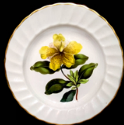
84. Derby moulded plate painted with St. John's Wort, titled, Blue mark pattern 197, 9.125 ins. D. c. 1796-1801