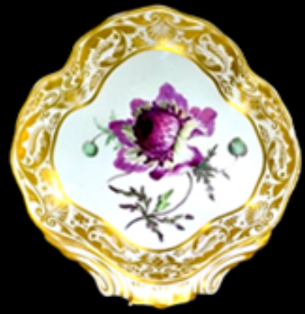
74. Derby shell shape botanical dish painted with an 'Anemone' in the style of Quaker Peg, under an elaborate gold border, titled, red mark, 9.5 ins. W c. 1815-20