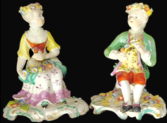
9. Derby pair of figures of a boy and girl depicting Spring and Summer, seated a flat scroll base patch marks, 4.5 ins. H. c. 1756-58