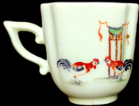
14. Derby coffee cup of square section with canted corners and a wishbone handle painted with a cockeral fight, verso with figures at a table, no mark, 2.25 ins. H. c. 1756-58