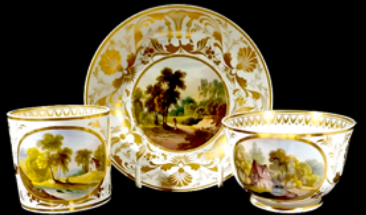
52. Derby coffee can, teacup and saucer painted with 'Near Loughbro' (sic), 'Near Breadsall, Derbyshire' and 'In Germany' with elaborate classical gilding, red mark, (saucer) 5.5 ins. D. c. 1810-15