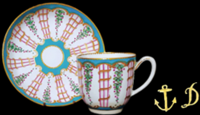
59. Chelsea Derby rare coffee cup and saucer painted with a Hop Trellis pattern, Separate Anchor and 'D' marks in gold, (saucer) 5 ins. D. c. 1772-75