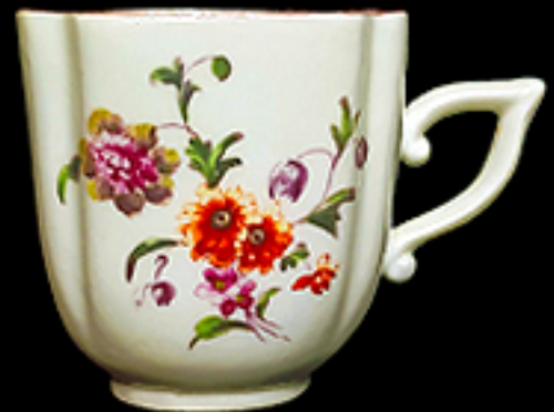
16. Derby coffee cup of square section with canted corners and a wishbone handle painted with flowers by the Cotton Stem painter, no mark, 2.25 ins. H. c. 1758-60