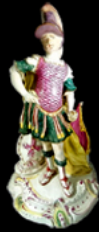
8. Derby large figure of Mars, wearing a Helmet, standing beside a shield and a flag, patch marks, 14 ins. H. c. 1765-75