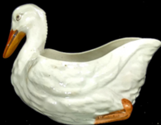
30. Derby rare duck sauceboat, the head being the handle and the tail the spout, the body naturally moulded, red mark, 4.375 ins. W. c. 1810