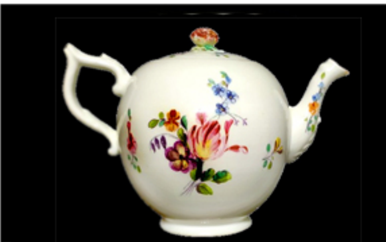
21. Derby small size teapot and cover painted with a large floral spray including a tulip, with wishbone handle and crabstock spout, no mark, 6.25 ins. W. c. 1765-68