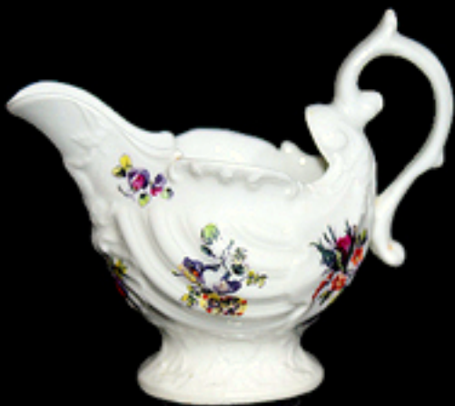
29. Derby early dolphin moulded ewer painted with delicate floral sprigs, patch marks, 3.875 ins. W. c. 1762-65