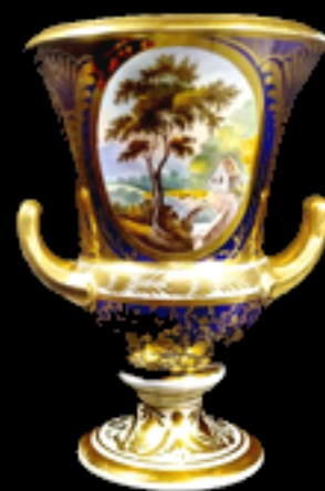
48. Derby two handled vase painted with oval landscape scenes, 'In Wales', and 'Near Bristol' on a cobalt blue and gilt ground, Black mark, 7 ins., H. c. 1805-10