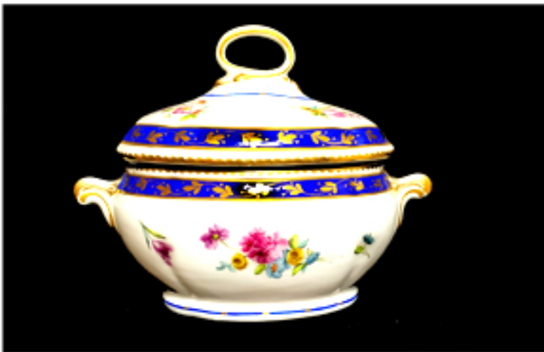
35. Chelsea Derby tureen and cover painted with flowers under a gilt light blue border, no mark, 7.5 ins. W. c. 1775-80