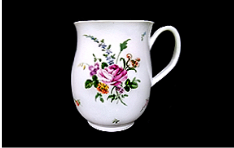
32. Derby baluster mug painted with a large floral spray under an everted rim, no mark, 6 ins. H., c. 1765-68