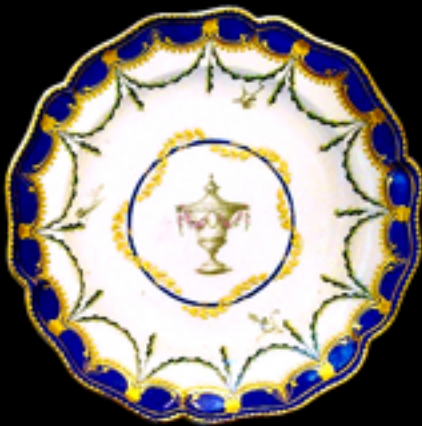
101. Chelsea Derby plate finely painted in neo-classical style with a chain of acanthus leaves, enclosing an urn, having a blue & gilt border, Anchor 'D' mark 8.75 ins. D. c. 1775