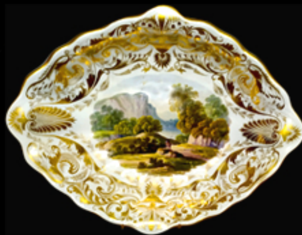
46. Derby dish painted with a central landscape, titled 'In Westmorland' under an elaborate classical gilt border, red mark, 11 ins. W. c. 1815-25