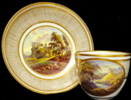
39. Derby teacup and saucer with elaborate interlinked gilding painted with 'Near Verona, Italy' and 'Near Lisbon', red mark, (saucer) 5.5 ins. D. C. 1810